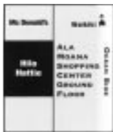
OAHU/Ala Moana (808) 973-3266

PLEASE PRESENT THIS COUPON TO CASHIER FOR REDEMPTION. THIS COUPON HAS NO CASH VALUE AND CANNOT BE COMBINED WITH OTHER DISCOUNTS, COUPONS OR CERTIFICATES. OFFER SUBJECT TO CHANGE WITHOUT NOTICE. EXPIRES 12/31/00