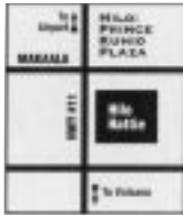
HILO (808) 961-3077