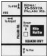
KONA (808) 329-7200