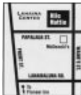
MAUI (808) 661-8457