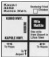
KAUAI (808) 245-3404